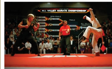
A Wells and K Wells' (Y7) version of Karate Kid.