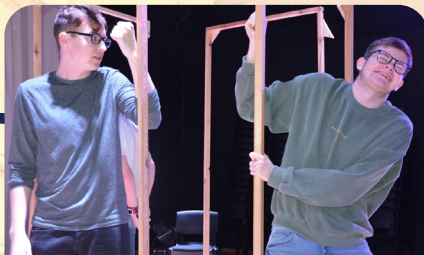
Coursework 1 - Reinterpretation of a Text – 'Two' by Jim Cartwright

The ability to overcome setbacks and remain confident and focused.