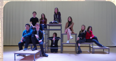
Saved by Edward Bond - Reinterpretation Component 1 mock exam