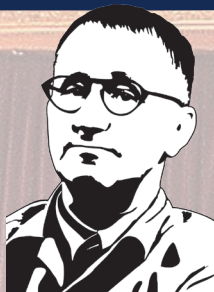
Introduction to Brecht