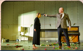
Hedda and Saved concept presentations