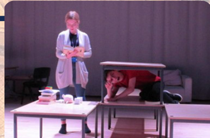
Explore Hedda Gabler and The Curious Incident of the Dog in the Night-Time practically