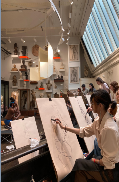
Image: attRAct in the Life Drawing Room

Sir John Soane RA (1753–1837) was an architect who specialised in the Neo-Classical style. He is most well-known for designing the previous Bank of England, Dulwich Picture Gallery and Fitzhanger Manor & Gallery. He received part of his architectural education at the RA and was elected a Royal Academician in 1802.