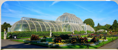
Trip to Kew Gardens

Natural Exploring a project and learning how to develop this with consistency. Students will respond to the work of artists to create their own.