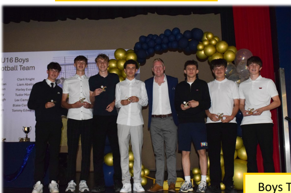
Boys Team of The Year