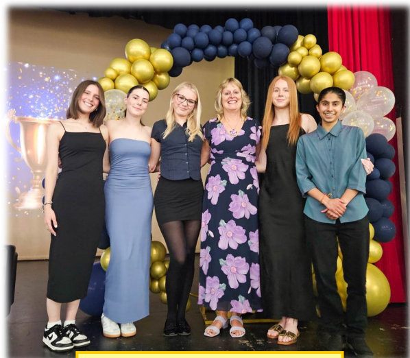
Excellent Leadership Contribution