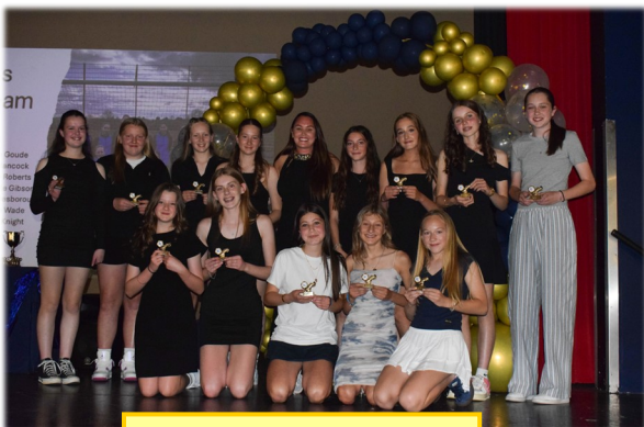
Girls Team of The Year